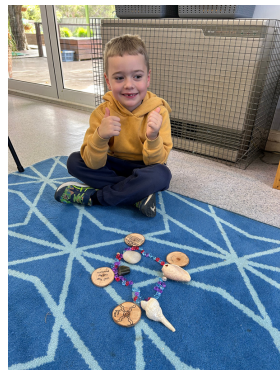
Creating art with loose parts and nature items