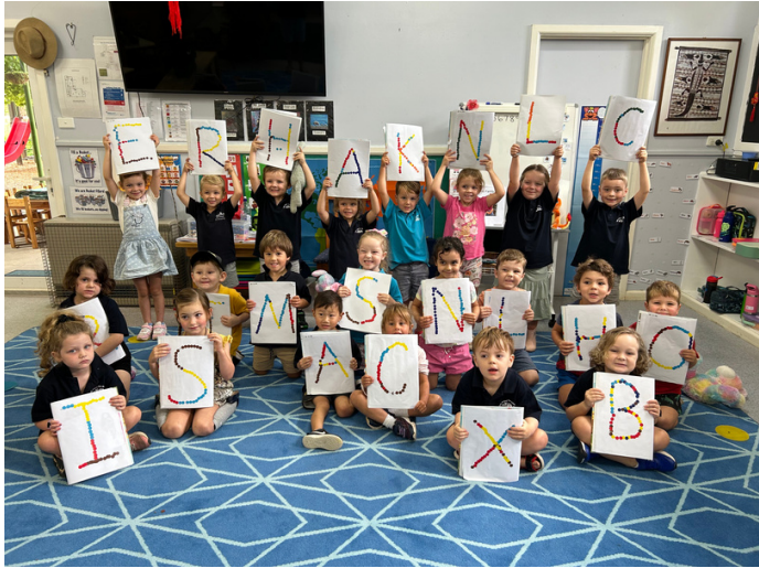
Learning the first letters of our name and practising fine motor skills with dot stickers.