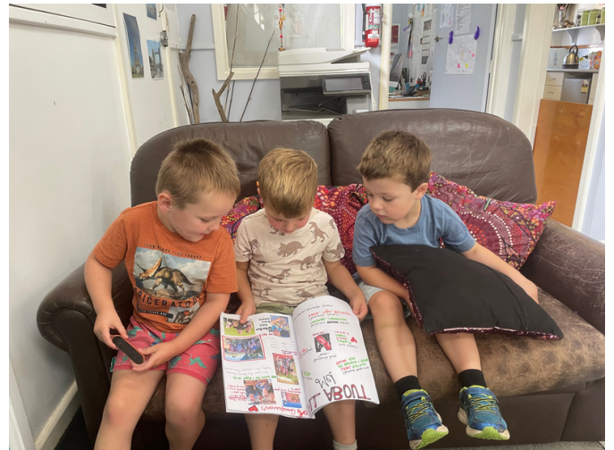
Our family books have been such a wonderful way for the children to share with everyone all about themselves and their families and are a beautiful link to home. We appreciate all the effort families have put in to making these - thank you!