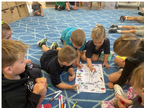
Exploring letters - what sounds do they make? What begins with this letter/sound?