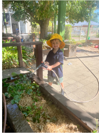
Caring for our kinder environment.